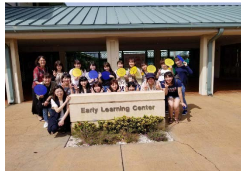
Seiwa Gakuen College: Students (Early Childhood Education)