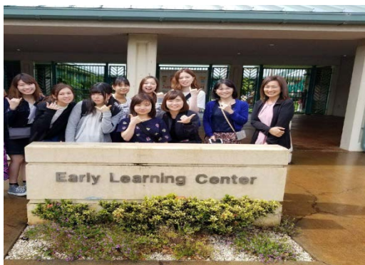
Niigata University: Students (Health & Nutrition)