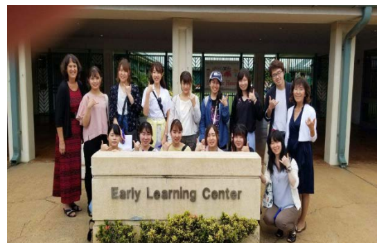
Niigata University: Students (Elementary Education)