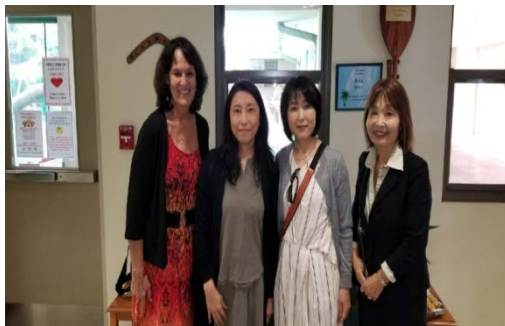
Ahikaga College Professors (Early Childhood Education)

Mary, Star of the Sea Early Learning Center has experienced wonderful opportunities to host visiting groups of college students, teachers, professors, dietitians and health care workers, primarily from Japan and Korea over the past 20 years. The experience benefits our community of young learners and educators by allowing us to share common experiences in the teaching and care of young children. Our young students also have the opportunity to interact with our visitors through conversations, songs, origami and other cultural activities. Our lifestyle in Hawaii is often described as a “rainbow of colors.” Within our school and teaching environment we have such a diversity of cultures among our children, teachers and staff. Although speaking English is our primary language of communication in our school, we have teachers and staff who are also able to speak in Hawaiian, Japanese, Korean, Mandarin, Vietnamese, Tagalog, Visayan, Spanish, French and Hindi-Punjabi (India)! Our recent Educational/School Tours Include: